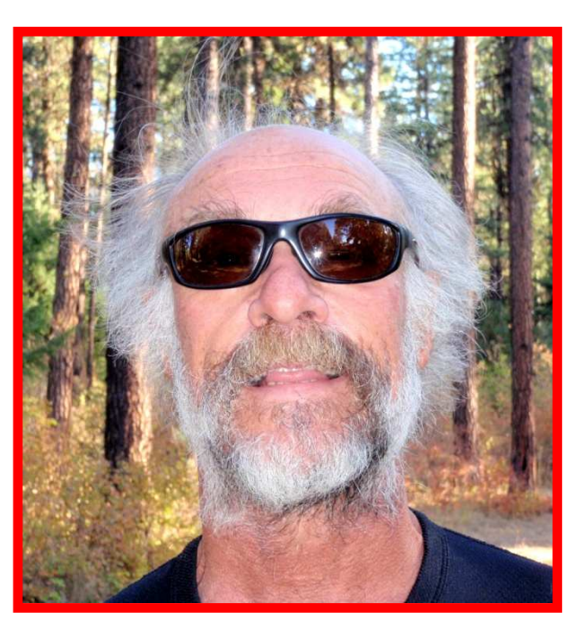
After the trip